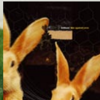
LP Spezialmaterial SM021LP006